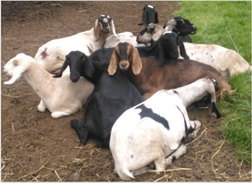
Contented Nubians.