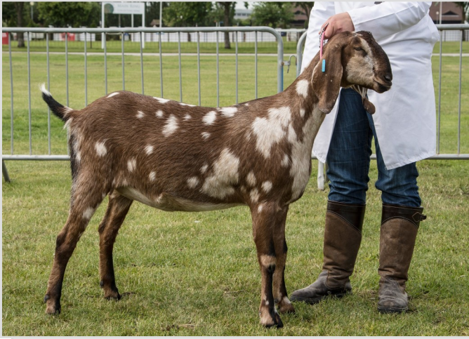
Emmadell Demi at the AN Breed Show 2013